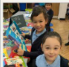
Read with Friends

A fun session for Parents and Carers to have breakfast and read with their Children