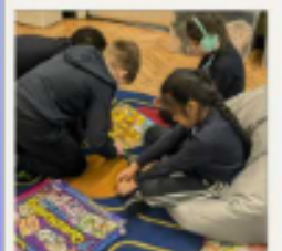
Play Word Games