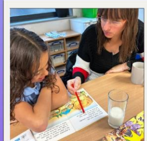
One on one time

Wednesdays from 8:10am in the Parents' Room